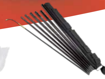
XL 8 S Telescopic extension (7 m) Art.No. 11935801