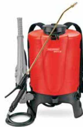
RPD 15 ATS Art.No. 12018101