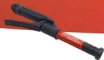
Vario Gun Art.No. 11558501