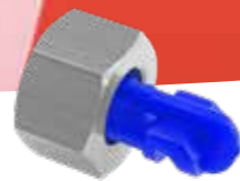
Herbicide floodjet nozzle Art.No. 10501803-SB