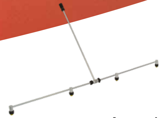
Spray boom aluminium Art.No. 11889501-SB