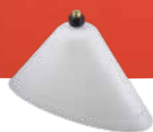
Spray hood oval Art.No. 10501606