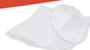
Biofilter Art.No. 11475701